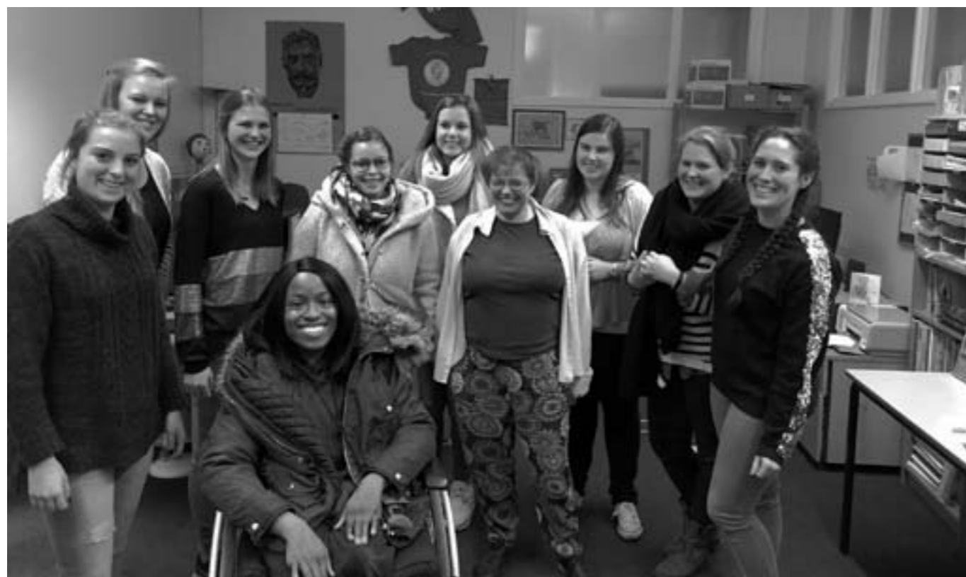
Visiting students from Belgium with ALLFIE staff and volunteers

Amidst our own future concerns, there has been significant policy and legislation change effecting every aspect of educational provision, and Inclusive Education has been increasingly under attack. There are serious concerns that have since emerged which have resulted in greater segregation of disabled people, directly affected our lives, our futures, and have violated our human rights. Our work with the UN, through ROFA, has been vitally important. We have been active in targeted events, meeting with individuals, to influence change.