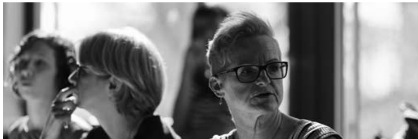
Tara speaking at the UN