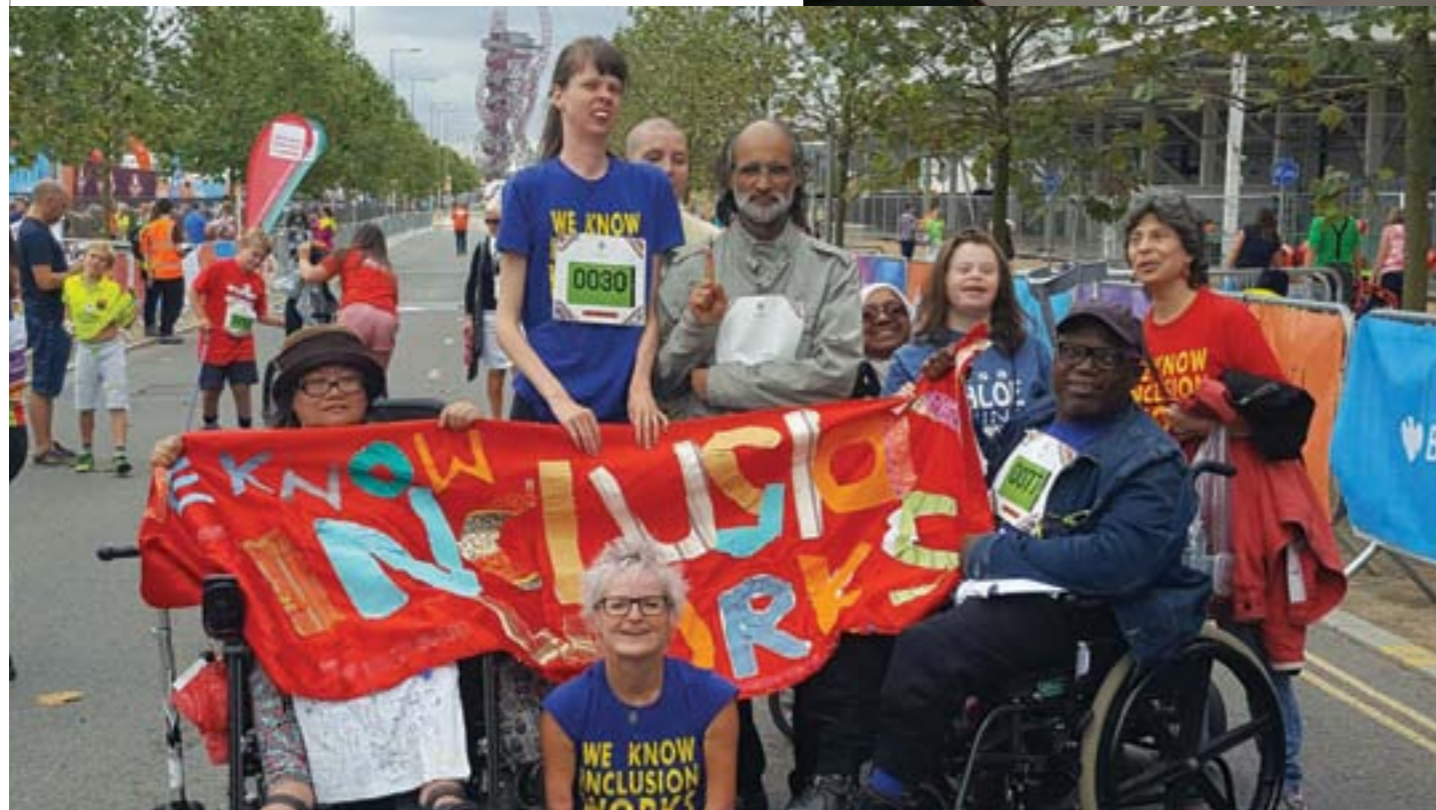
ALLFIE staff and supporters at the Parallel London event (below) Behaviour management chart, Eastlea School (top)